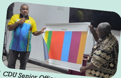
MoET CDU Senior Officers present CIP data wall during the PCIO refresher training - 16/02/2026