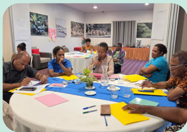
MoET and VAESP senior officers participates in the presentation of the preliminary results of Vanuatu positive school deviance study - 19/02/2026