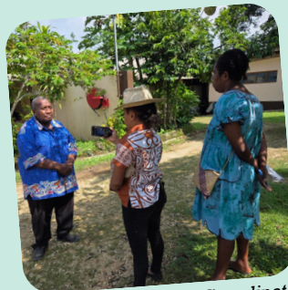
MoET ECE Acting National Coordinator shares essential ECE messages with journalists - 25/03/2026