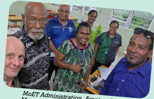
MoET Administration, Asset and Project Management Unit PEO with Beverly Hills School Council members and VAESP officer discussion preparation work for the opening ceremony of the school - 05/02/2026