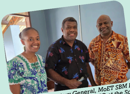
TSC Acting Secretary General, MoET SBM PEO and MoET Education Services PEO at the School Principals' Induction Training - 23/02/2026