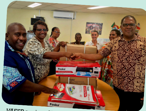
VAESP senior officers hands over laminating machines and materials to MoET ECE team to distribute to Provincial Education Offices - 22/01/2026