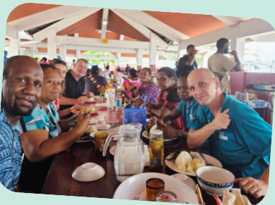
VAESP team lunch at Port Vila market - 25/02/2026