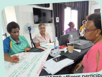
PCIO, MoET and VAESP officers participate in the PCIO refresher training - 18/02/2026