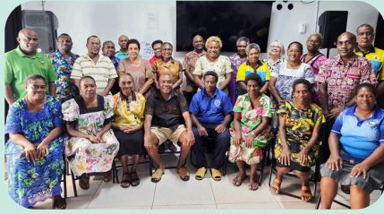
▲ MoET Senior Officers from Education Services, CDU, SBM along with PCIOs and VAESP Senior Officers

From Monday 16 to Friday 20 February, eight Provincial Curriculum Improvement Officers (PCIOs) from across the country participated in a VAESP-facilitated refresher training including the implementation of morning routine and read aloud to students. They presented the progress of their work in supporting Kindy to Year 3 teachers and principals. PCIOs have been working to empower teachers and school leaders to improve the quality of early childhood and primary education in 40 focus schools.