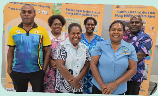
MoET's 6 ECE Provincial Coordinators participate in the ECE teaching and learning resources training - 23/03/2026