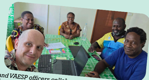
MoET and VAESP officers collaborate with Malampa Education Officers for advocacy activity preparation - 26/03/2026