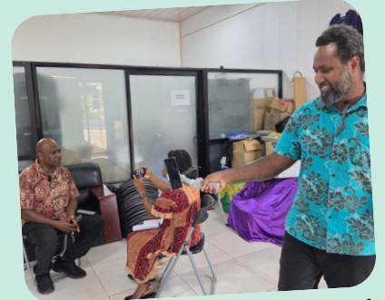
The MoET Communications Officer conducts a media interview with the Education Services PEO regarding MoET's leading role in executing the foundational learning reform - 20/02/2026