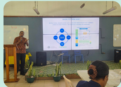
VAESP senior officer explains instructional leadership during School Principals' Induction training - 27/02/2026