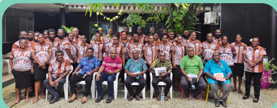
▲ MoET Senior Officers with VBTC Staff